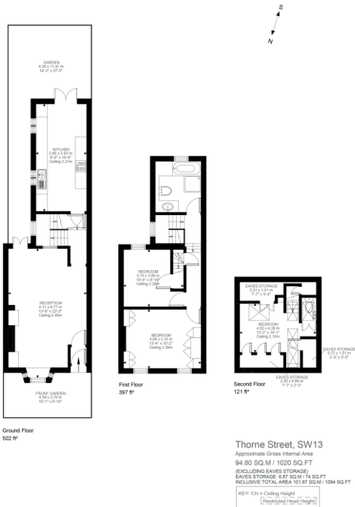
Illustration for identification purposes only. Not to scale. Floor Plan Drawn According To RICS Guidelines.

Barnes Lettings 020 8878 1115 barnes@carterjonas.co.uk 70 White Hart Lane, Barnes, SW13 0PZ