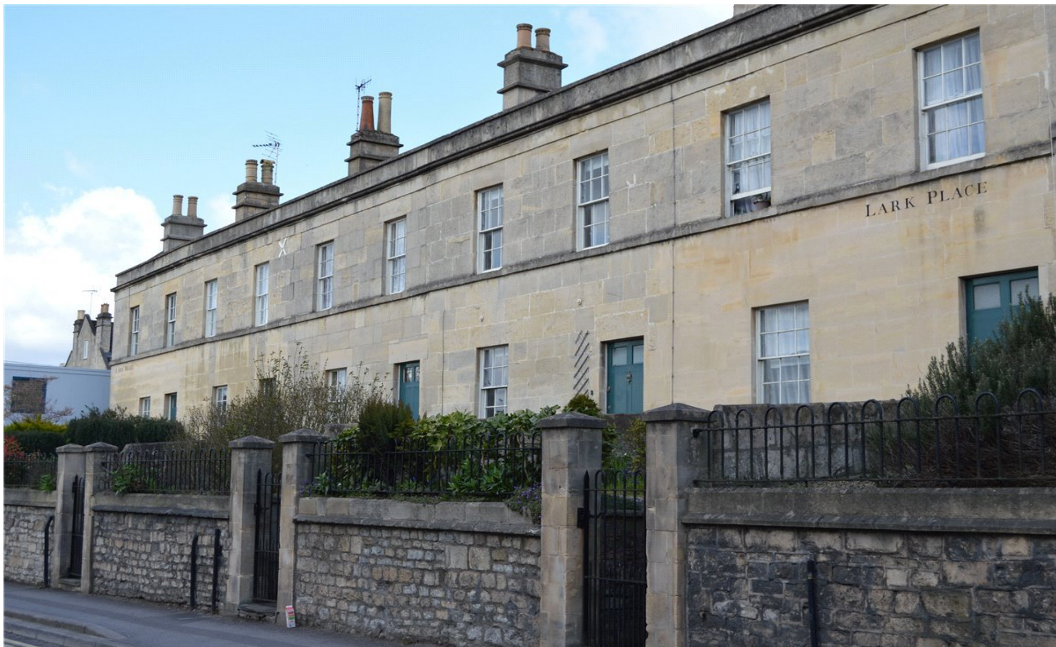
LARK PLACE, BATH, BA1 £1,400 per month*