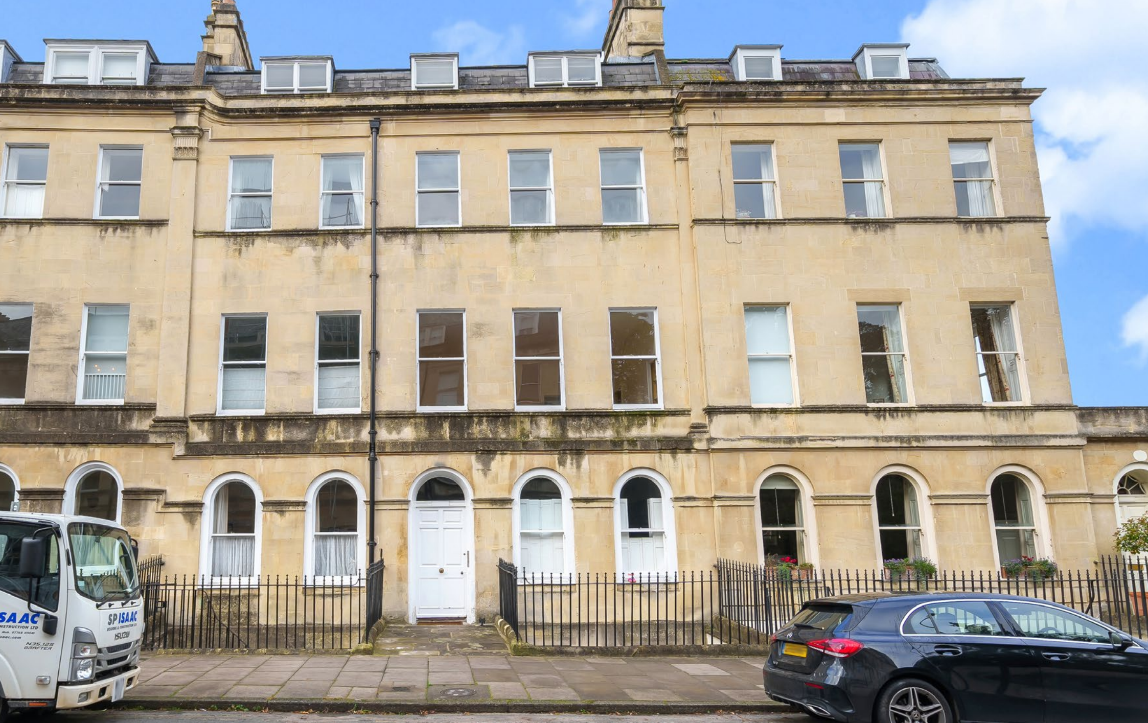
FLAT 11, 18 HENRIETTA STREET Bath