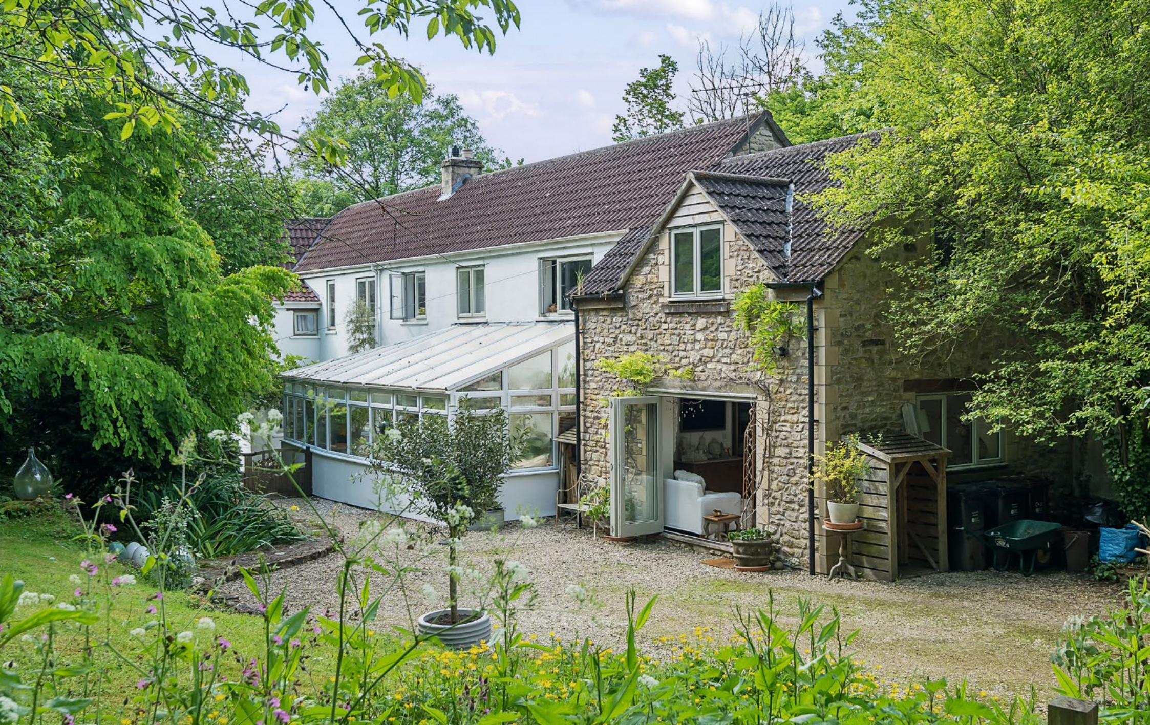
THE OLD MILL Norton St. Philip