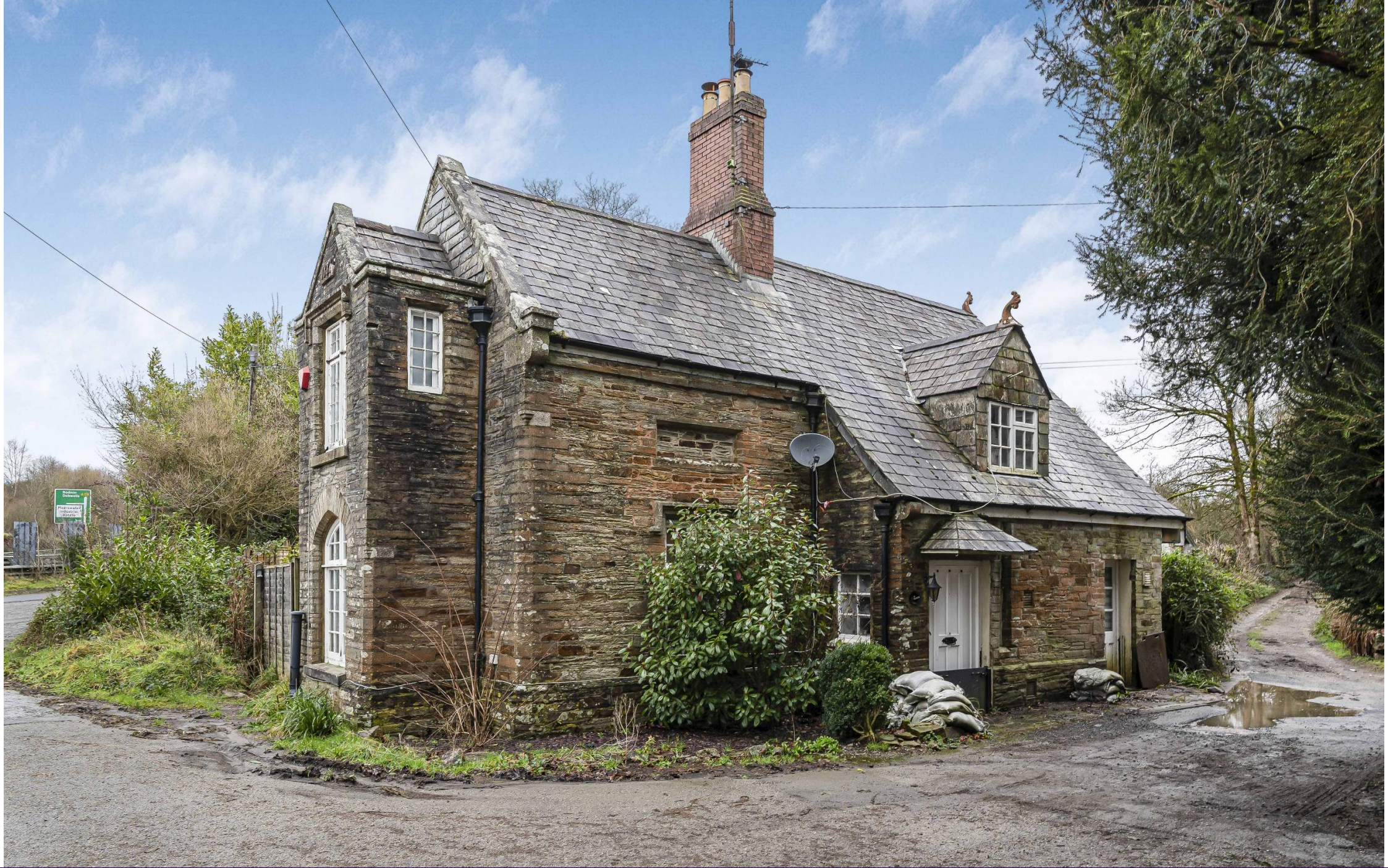
THE TOLL HOUSE, LOOE MILLS, LISKEARD, CORNWALL