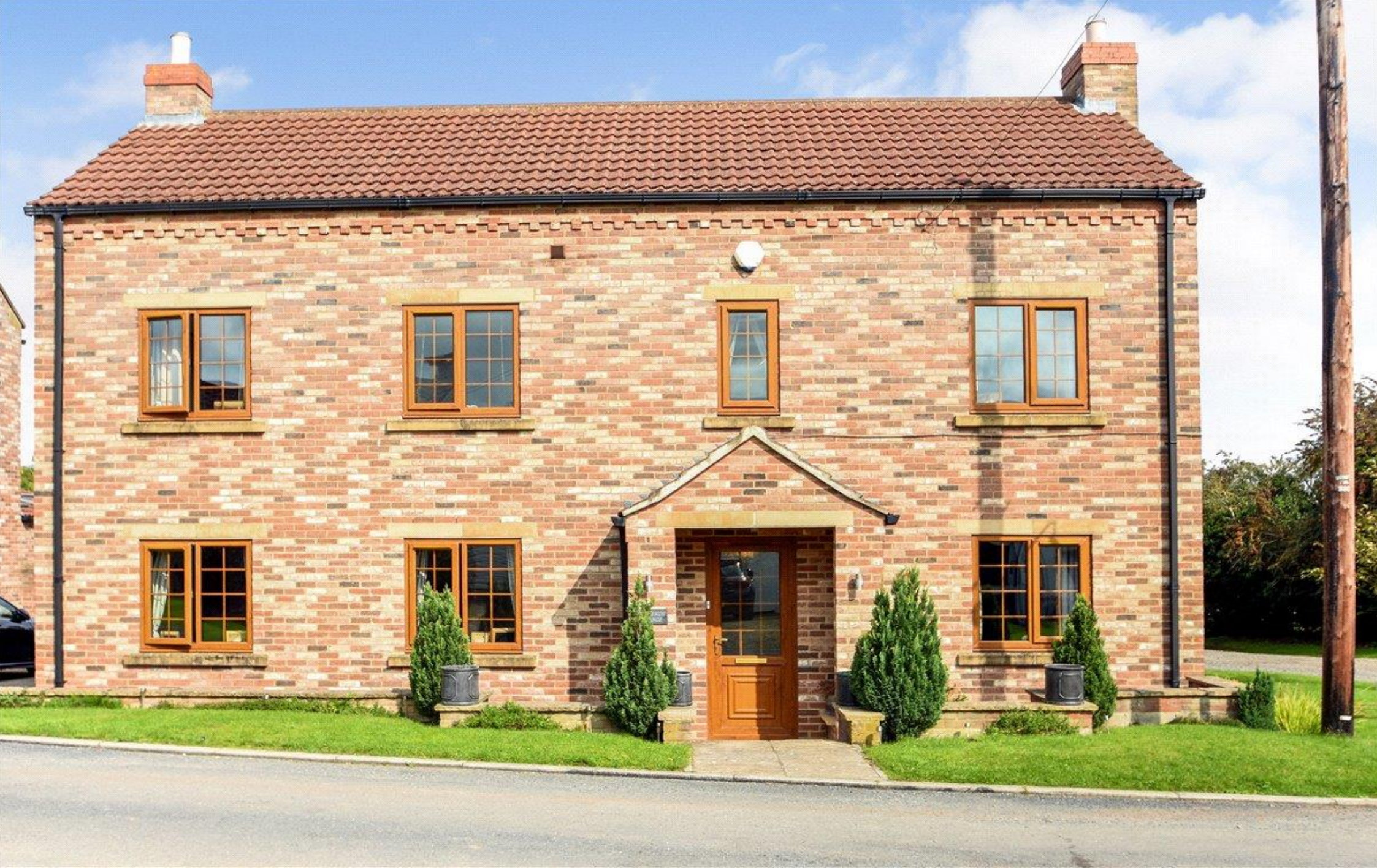
SWALESIDE GRANGE, GREEN END, ASENBY, THIRSK, NORTH YORKSHIRE, YO7 3QX £2,400 per month