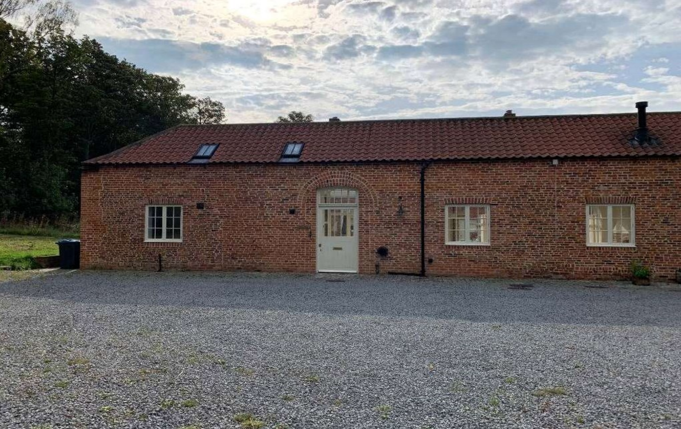
STABLE COTTAGE, THE COACH HOUSE, EAST ROUNTON, NORTHALLERTON, DL6 2LQ £1,000 per month