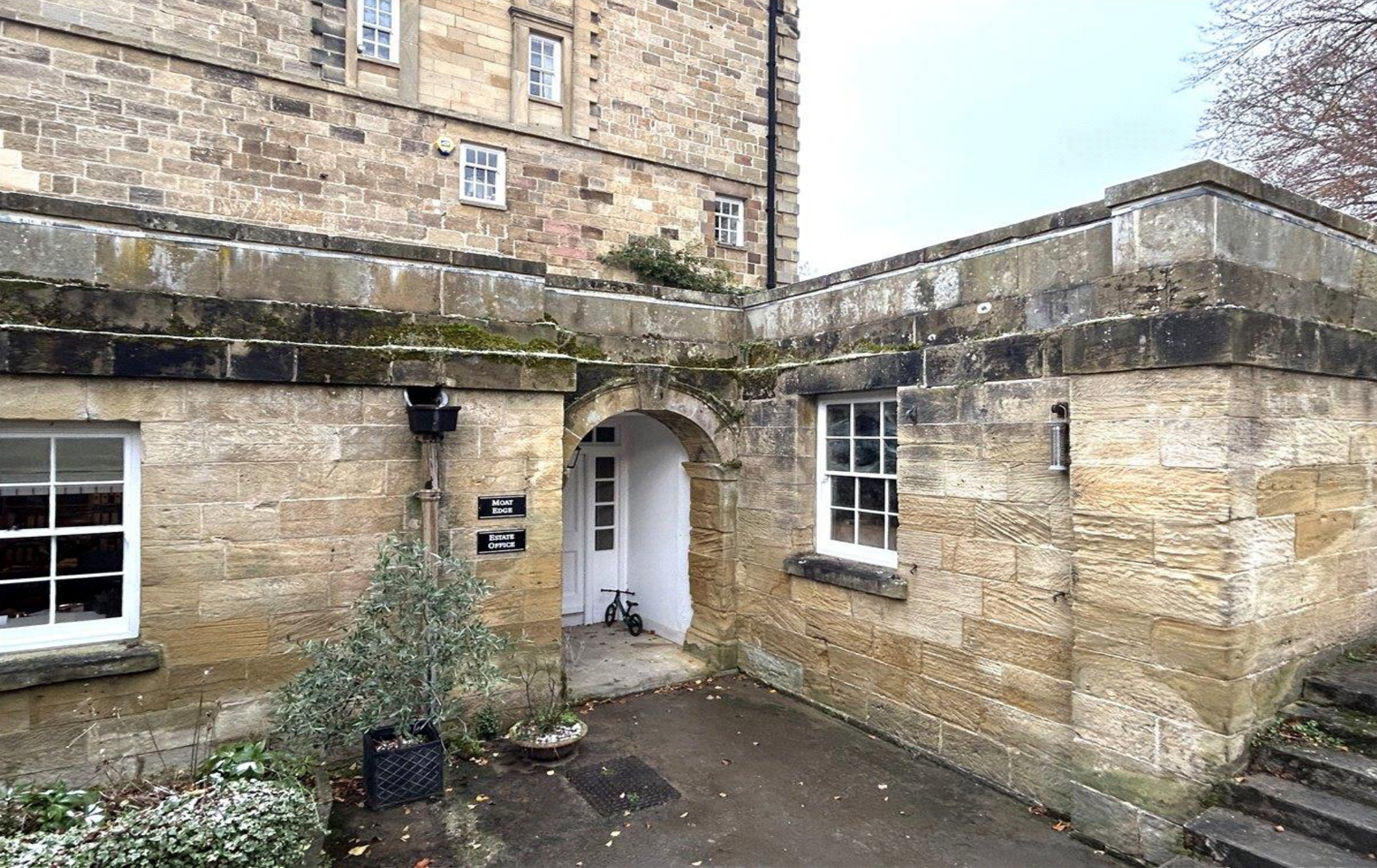
MOAT EDGE, ARNCLIFFE HALL, INGLEBY ARNCLIFFE, NORTHALLERTON, DL6 3PA £650 per month