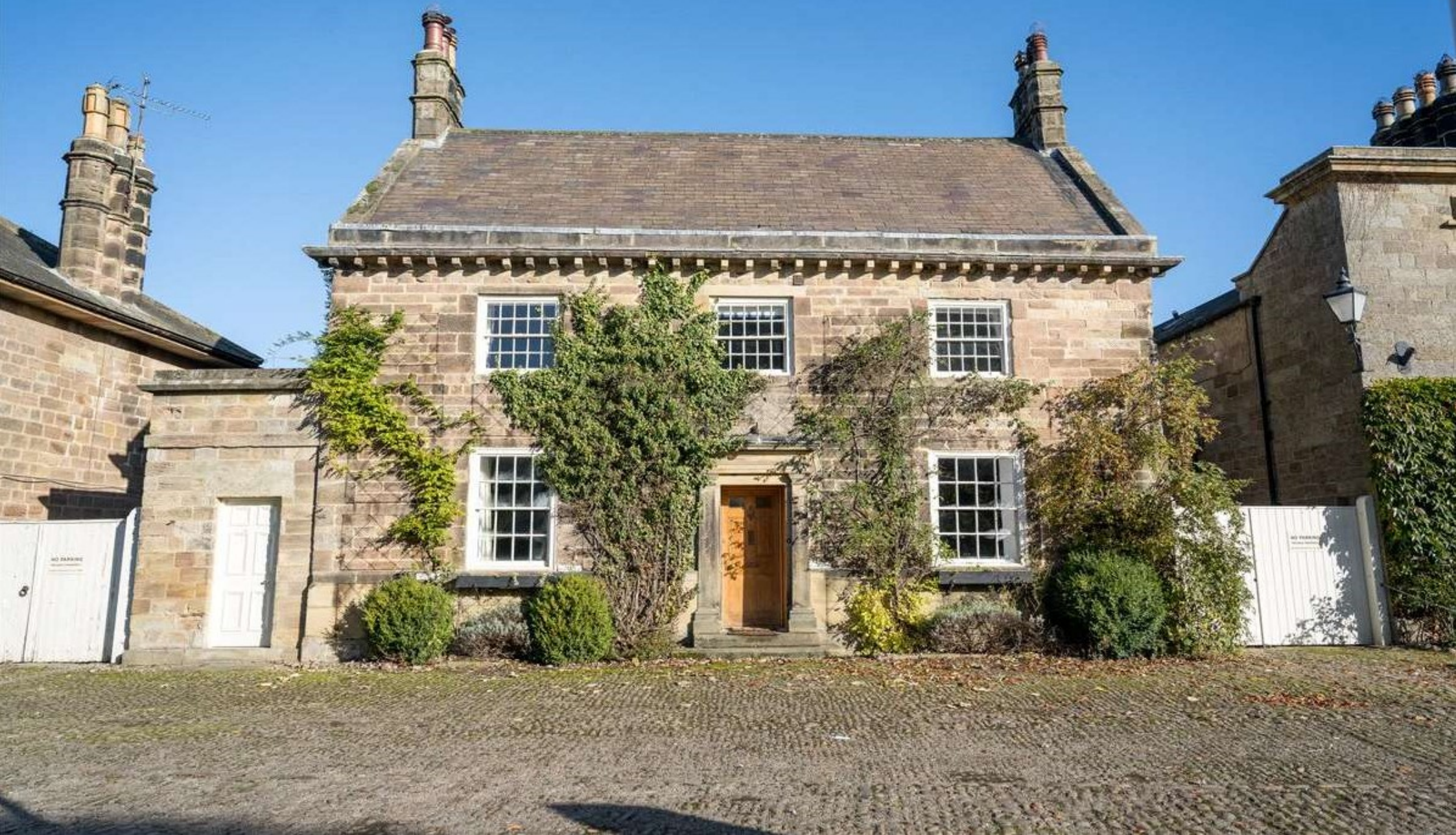
CHANTRY HOUSE, RIPLEY, HARROGATE, NORTH YORKSHIRE, HG3 3AY £4,500 per month