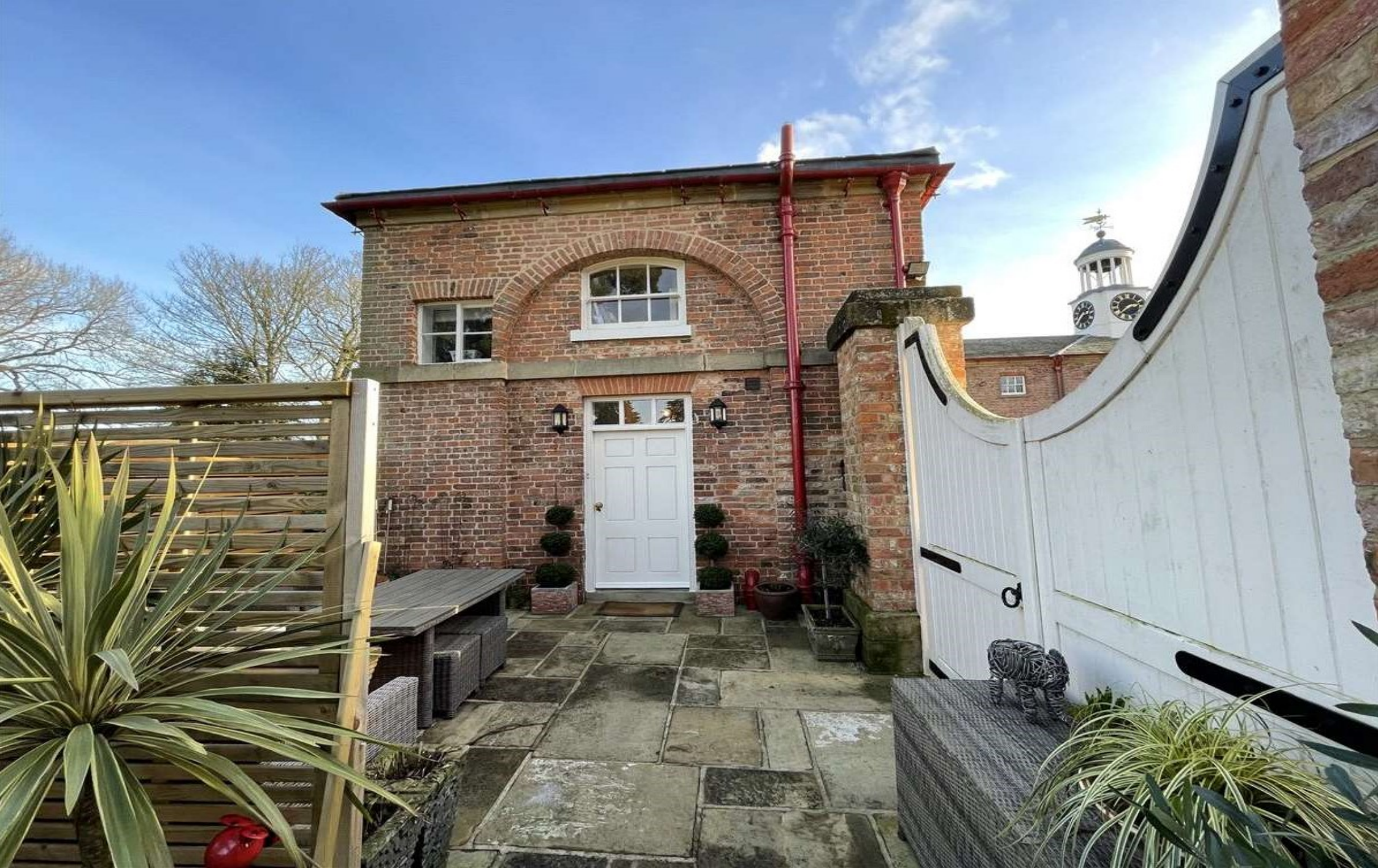
IVY COTTAGE, RIBSTON ESTATE, LITTLE RIBSTON, LS22 4EZ £1,895 per month