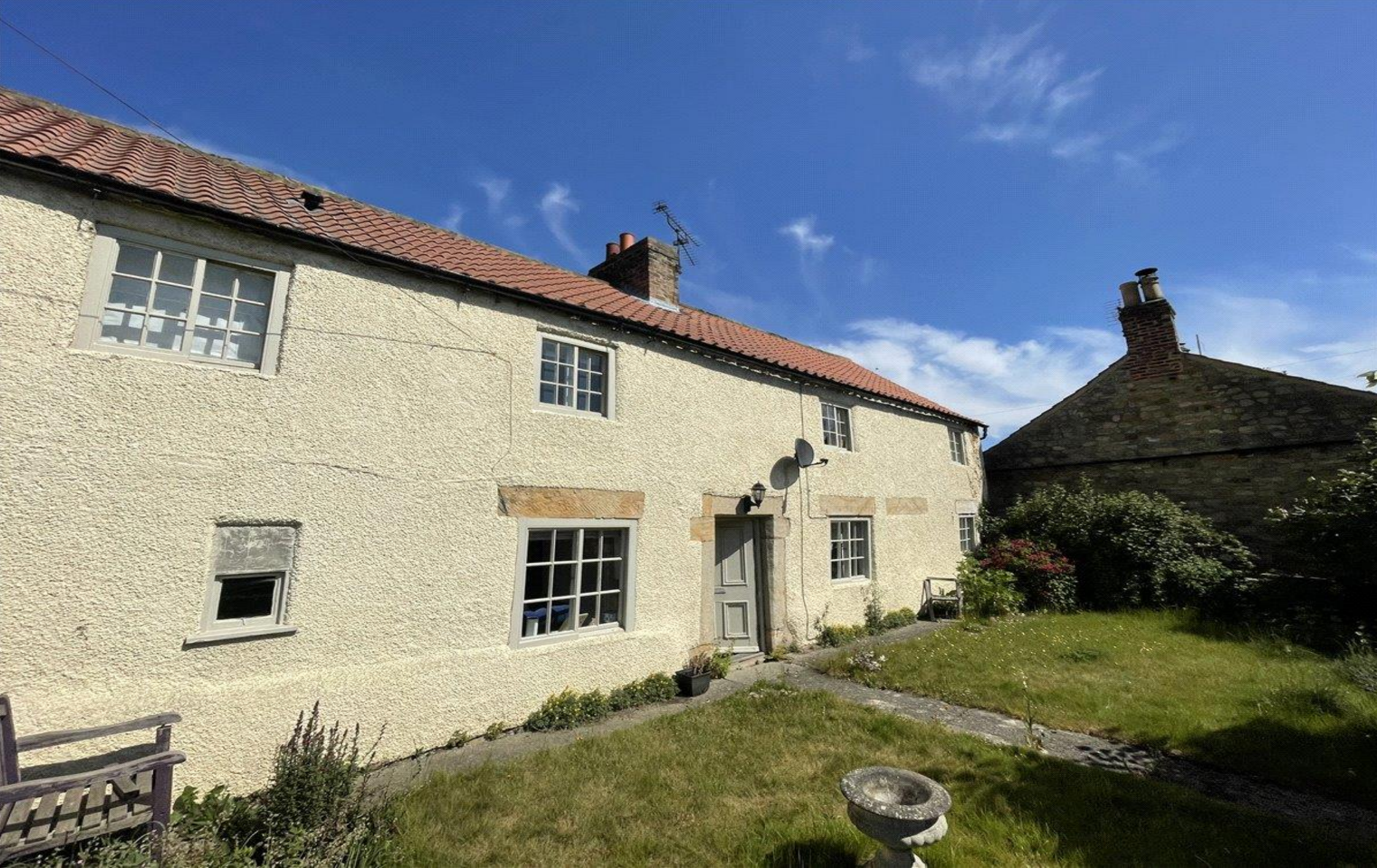
JASMINE COTTAGE, MAIN STREET, WEST TANFIELD, RIPON, NORTH YORKSHIRE, HG4 5JJ £1,350 per month