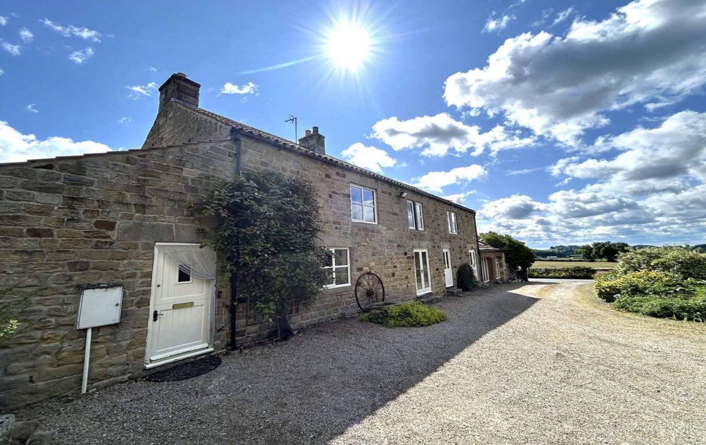
THE BARN, BAY TREE FARM, ALDFIELD, RIPON, NORTH YORKSHIRE, HG4 3BE £2,500 per month