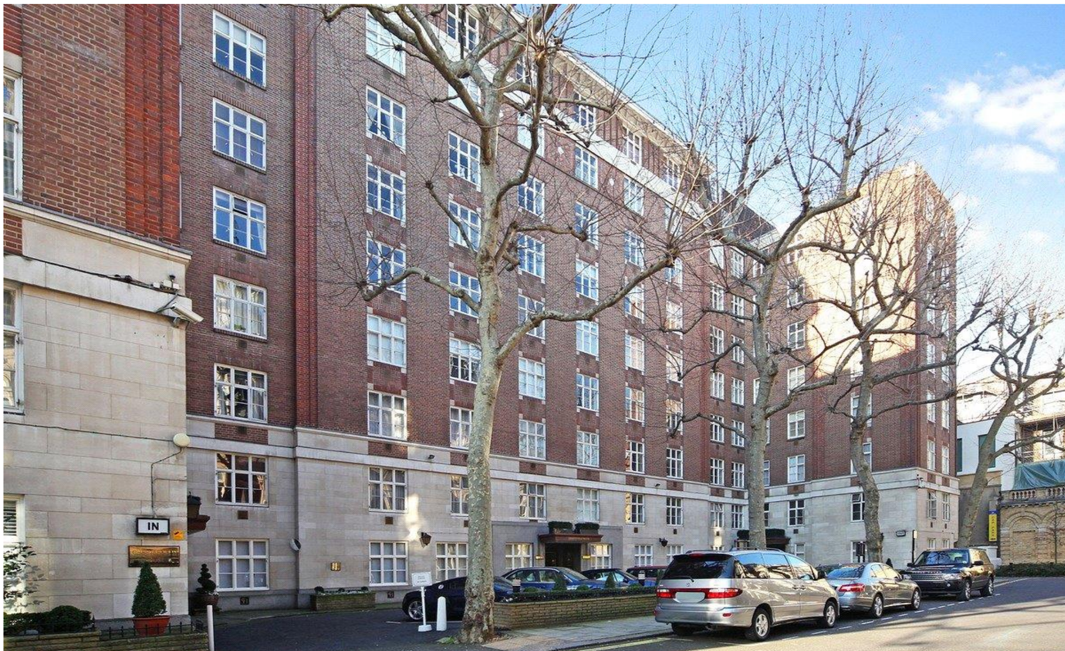
CHESTERFIELD HOUSE, CHESTERFIELD GARDENS, W1J £1,100,000