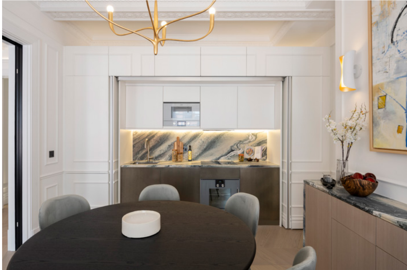
Claridge House Mayfair W1K Guide price: £6,500,000

Sitting in the heart of Mayfair within a portered building is this brand newly refurbished three-bedroom, three-bathroom prestigious apartment.