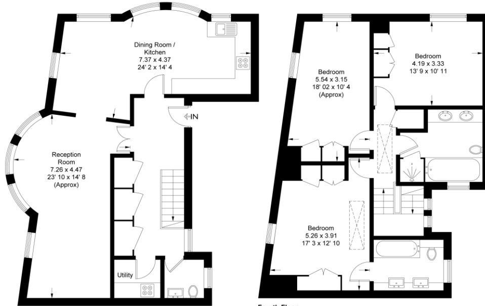
Third Floor 769 sq ft / 71.5 sq m