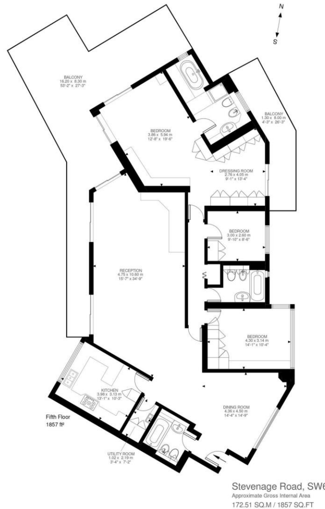
Illustration for identification purposes only. Not to scale. Floor Plan Drawn According To RICS Guidelines.