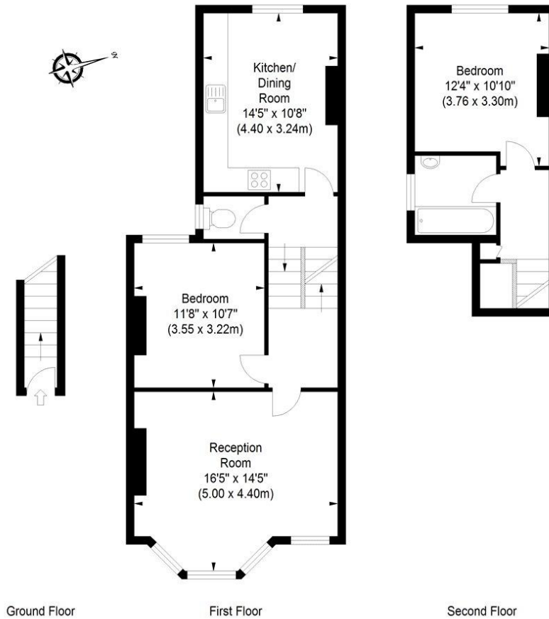
ILLUSTRATION FOR IDENTIFICATION PURPOSES ONLY

Approximate Gross Internal Area 848 sq ft / 78.77 sq m