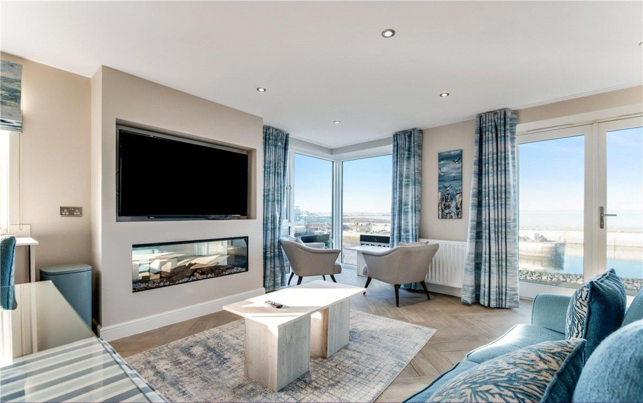
FARNE HAVEN, FARNE HOUSE £575,000